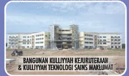
BANGUNAN KULLIYAH KEJURUTERAAN & KULLIYAH TEKNOLOGI SAINS MAKLUMAT