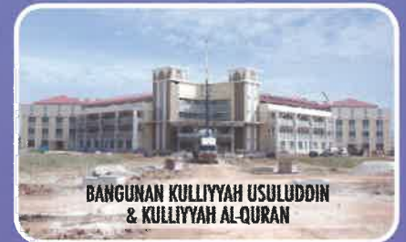
BANGUNAN KULLIYAH USULUDDIN & KULLIYAH AL-QURAN