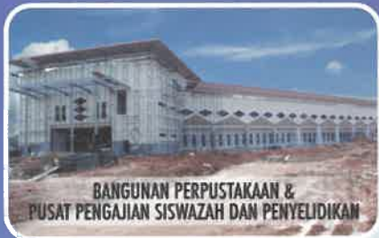
BANGUNAN PERPUSTAKAAN & PUSAT PENGAJIAN SISWAZAH DAN PENYELIDIKAN