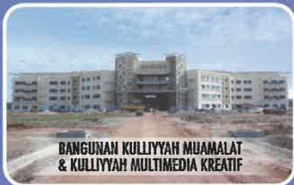
BANGUNAN KULLIYAH MUAMALAT & KULLIYAH MULTIMEDIA KREATIF