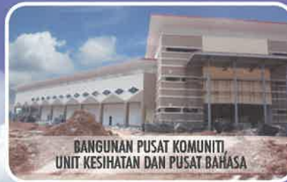
BANGUNAN PUSAT KOMUNITI, UNIT KESIHATAN DAN PUSAT BAHASA