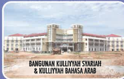
BANGUNAN KULLIYAH SYARIAH & KULLIYAH BAHASA ARAB