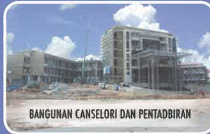
BANGUNAN CANSELORI DAN PENTADBIRAN