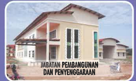
JABATAN PEMBANGUNAN DAN PENYENGKARAAN